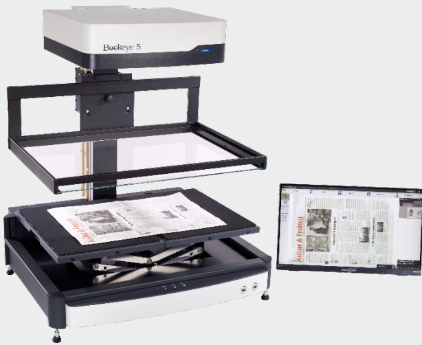
Scanning newspapers up to A2 with flat glass plate.

The book cradle enables perfect scans while protecting the book binding. The V-shaped glass plate can be removed in a few simple steps. Depending on requirements, the Bookeye® 5 V2 Archive can now be used with an optional flat glass plate or without a glass plate at all.