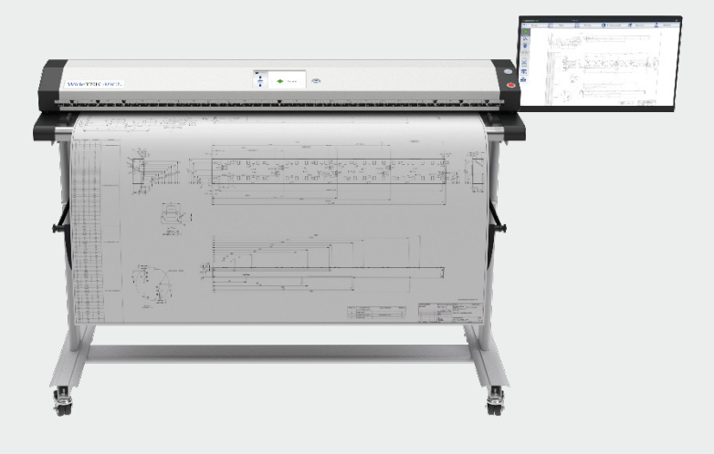
Large documents like maps rewind to the front or fall into the paper catch.

The WideTEK® 48CL produces extraordinarily sharp images, with color accuracy even superior to competing CCD scanners. Document rotation is done on the fly, a scan of an E-sized / A0 document in landscape at 300 dpi in 24bit color takes less than 7 seconds to scan and another 2 seconds to crop & deskew, preview and store.