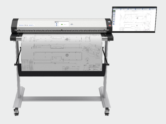
Large documents like maps rewind to the front or fall into the paper catch.

The WideTEK® 36CL produces extraordinarily sharp images, with color accuracy even superior to competing CCD scanners. Document rotation is done on the fly, a scan of an E-sized / A0 document in portrait mode at 300 dpi in 24bit color takes less than 7 seconds to scan and another 2 seconds to crop & deskew, preview and store.